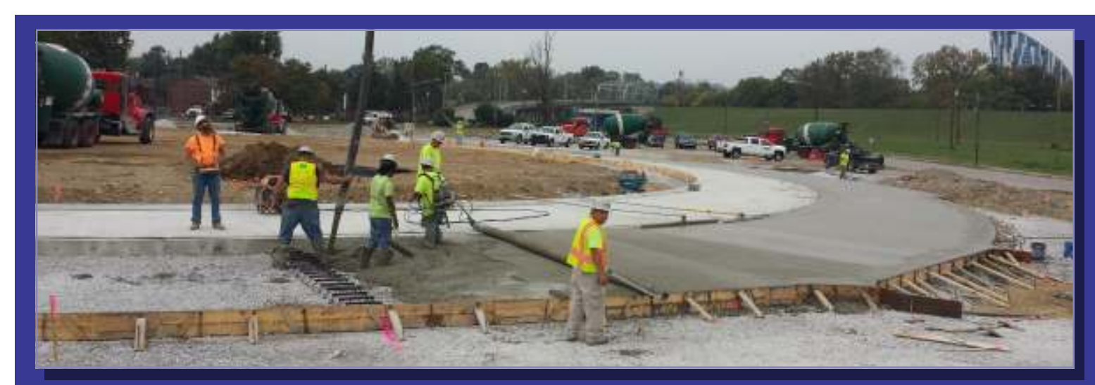
Above: Prus workers place another lane of the new concrete Roundabout near Newport.

Below: A Hilltop Ready Mixed Truck fills the pump truck for the Roundabout operation