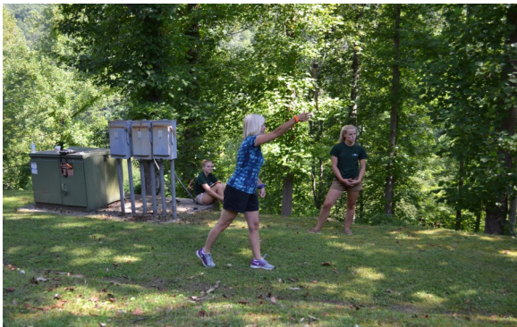
My Mom's Got This!!!