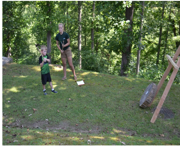
I think I can!