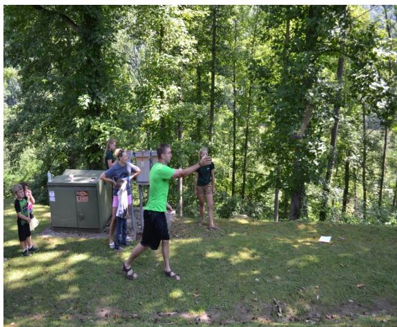
Go Dad go!