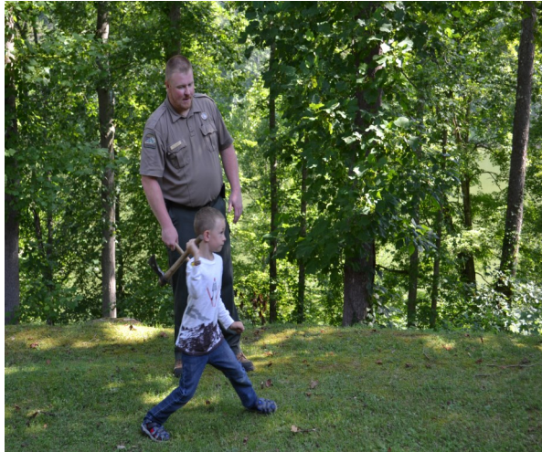
I got this!