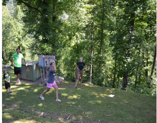
Mom's a Natural!