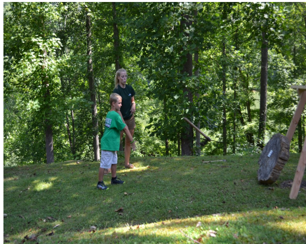
That target is mine!!!