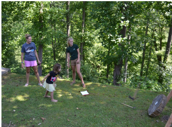
Hey Mom, is this right?