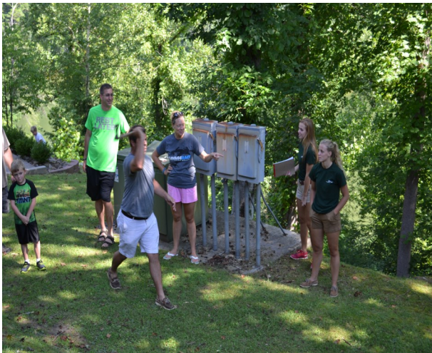
Everybody Duck! My Dad is throwing!!!